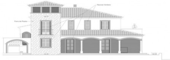
FACHADA LATERAL DERECHA Nivel: 0.00